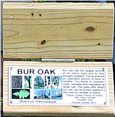
Tree signs are made of two 4"x 9" sealed wood panels that are designed for durability and easy accessibility.