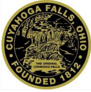
Don Walters Mayor