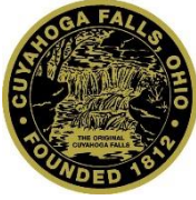
Don Walters Mayor