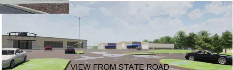
VIEW FROM STATE ROAD