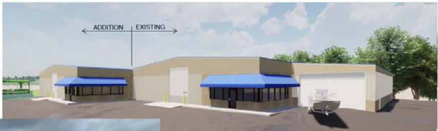
SOUTH AND WEST ELEVATIONS