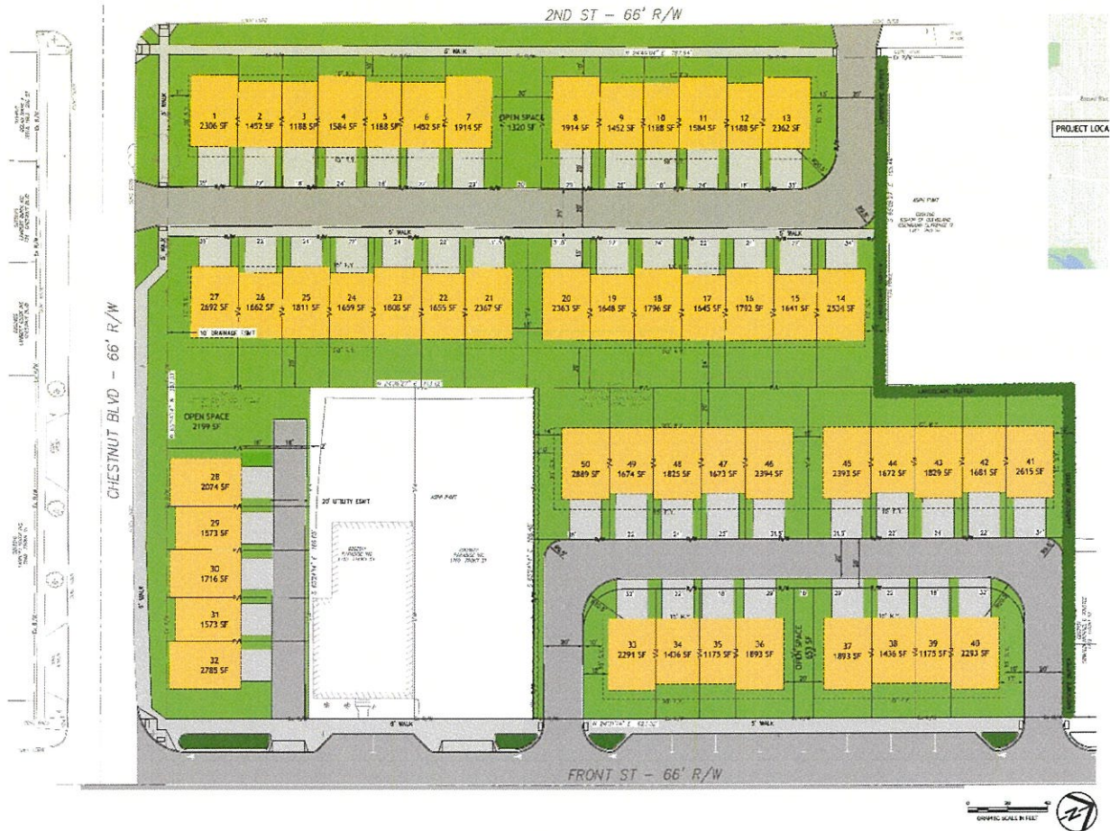
Figure 1 - The Glens Preliminary Subdivision Plat