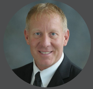
Mayor Don Walters City of Cuyahoga Falls